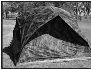
STEP 18- This is how your as-assembled tent should look.

WARNING: Texsport tent fabrics are flame retardant treated per C.P.A.I.-84 specification. However, for your safety, we recommend that NO OPEN FLAME BE USED IN OR NEAR YOUR TENT.