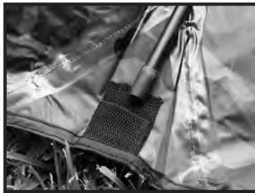
STEP 10- Assemble the short-rainfly poles (C) and insert into the web pockets.