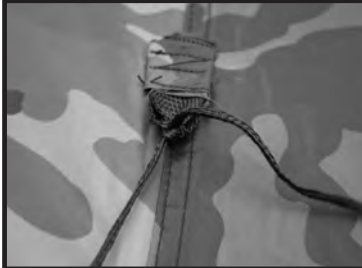
STEP 15- Tie the other end of the guy rope to the tabs on the fly.