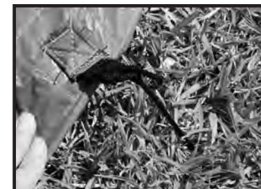
STEP 8- Stake down at the tabs.