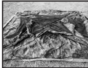
STEP 3- Your poles should form an "X" as shown above.