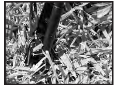
STEP 12- Drape the assembled rainfly over the tent and secure by hooking into the pin and ring.