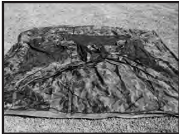
Step 1 - Spread out tent skin.