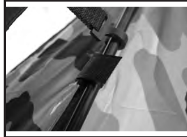
STEP 13- Secure the rainfly (D) to the tent with hook 'n' loop.