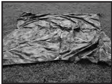
STEP 9- Spread out the rainfly(D) bottom side up.