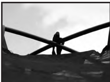
STEP 5- Attach toggles at the top of the tent skin (A) to secure poles.