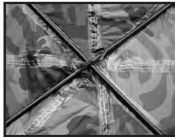
STEP 11- Tie poles together to secure.