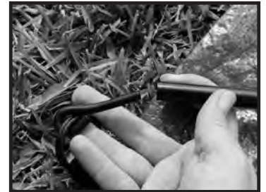
STEP 4- Insert the pin and ring into tent poles at all four corners.