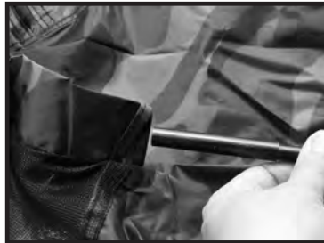
STEP 2- Assemble the 2 long tent poles (B), and insert into tent sleeve.