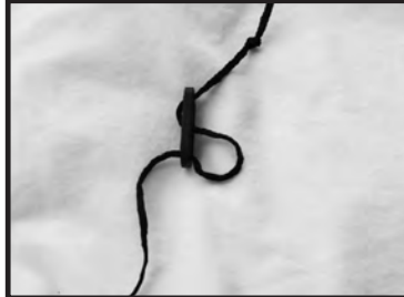
STEP 14- It is recommended to secure your tent with guy ropes. Insert the guy rope into clew as shown above.