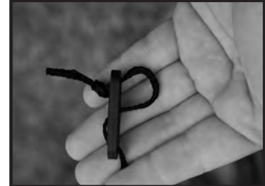
STEP 16- Loosen the guy rope as shown to wrap around a stake.