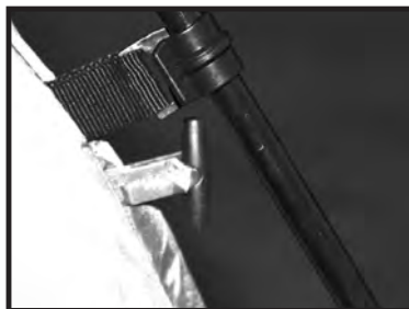
Step 6 - Attach the speed clips onto the tent poles.