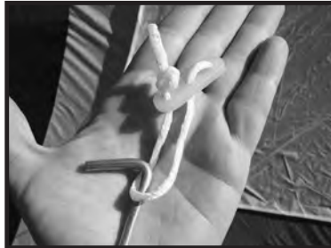
Step 14 - Loosen the guy rope as shown to wrap around a stake.