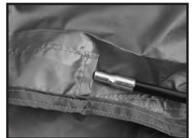
Step 8 - This is what your tent should like without the rainfly.