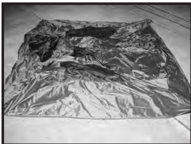
Step 1 - Spread out tent skin (B).