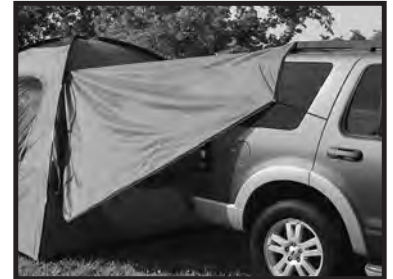
Step 16 - Use the hooks to attach to the fender, wheel well, door, or luggage rack to create an awning/canopy.

WARNING: Texsport tent fabrics are flame retardant treated per C.P.A.I.-84 specification. However, for your safety, we recommend that NO OPEN FLAME BE USED IN OR NEAR YOUR TENT.