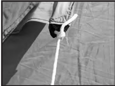
Step 13 - Tie the other end of the guy rope to the tabs on the fly.