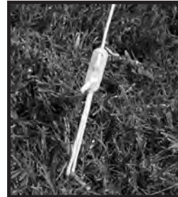
Step 15 - Stake down the guy rope and adjust the tension on the guy rope by sliding the clew up or down.