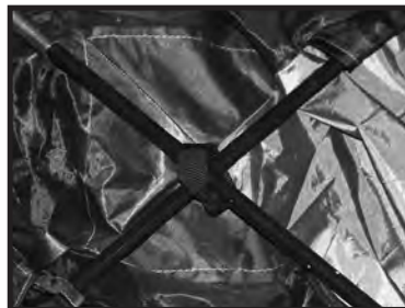
Step 3 - Make sure you insert the poles through the center roof loop to secure.