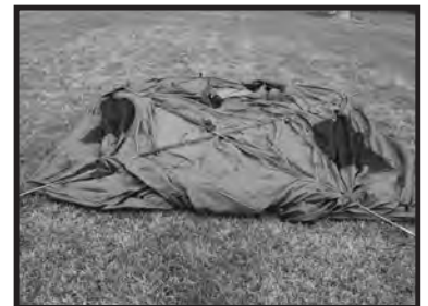
Step 4 - This is how your tent should look at this point.