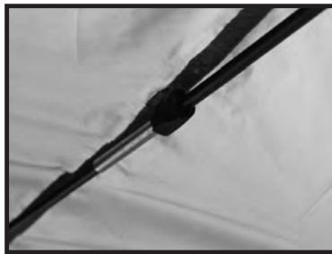
Step 11 - Secure awning pole with the hook 'n' loops to the leg poles.