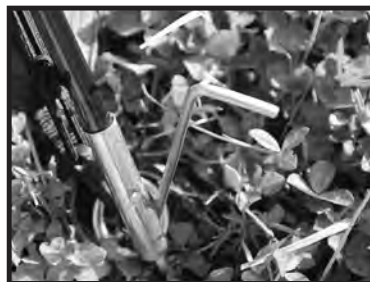
Step 7 - Insert the pin into the leg poles.