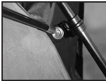
Step 10 - Insert the awning pole into the grommets on tent skin to create an arch.