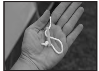
Step 12 - To secure your tent with guy ropes. Insert the guy rope into clew as shown above.