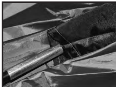
Step 2 - Assemble the 2 long poles (D) and insert through the tent sleeves to form an "X".