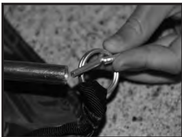
Step 5 - Insert the pin into the poles.