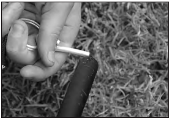
STEP 7 - Insert the pin into the leg poles.