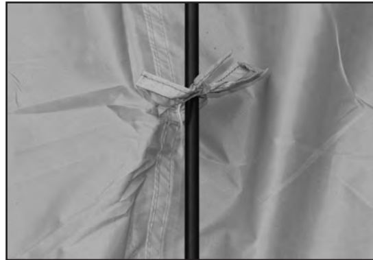
STEP 14 - Tie pole to fly.