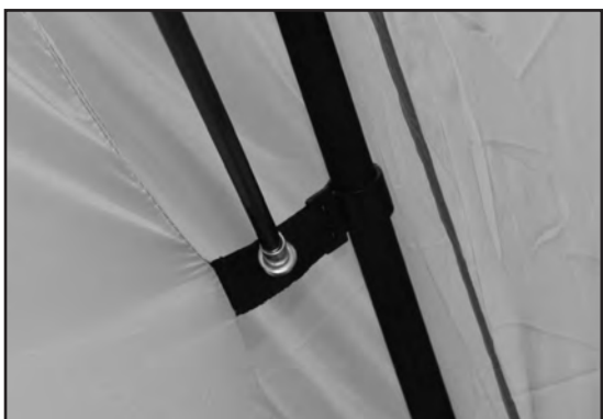
STEP 16 - Insert the awning pole into the grommets on tent skin to create an arch.