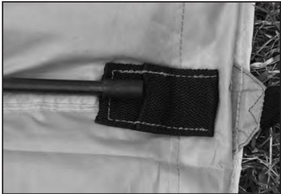
STEP 13 - Assemble the fly center pole (C) and insert into the web pocket.