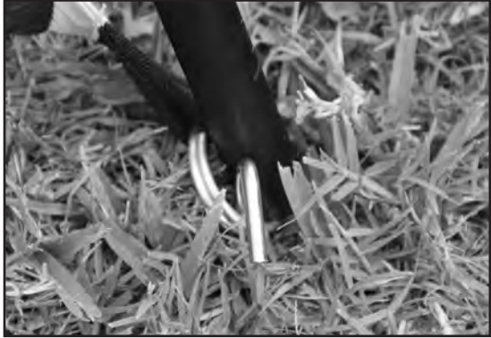
STEP 10 - Stake down at the ring and tabs around tent.