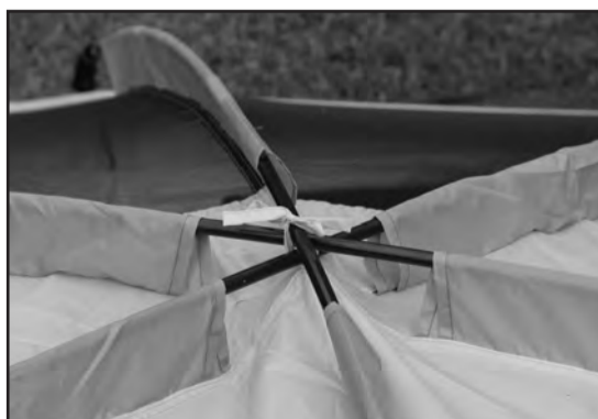
STEP 5 - Tie roof poles together.