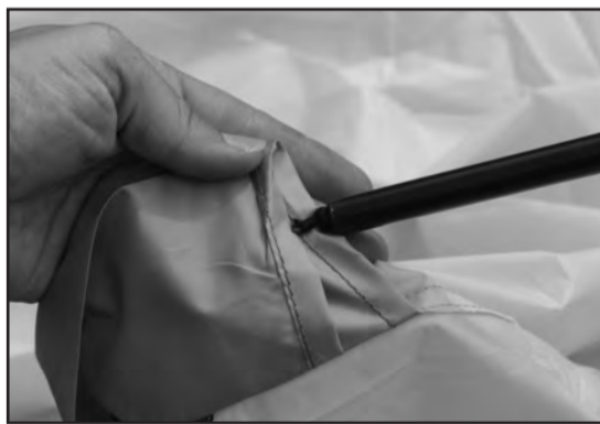
STEP 2 - Assemble the 2 long poles (A) and insert through the tent sleeves to form an "X". Assemble the short roof pole (D) and insert through the center roof sleeve.