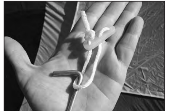
STEP 21 - Loosen the guy rope as shown to wrap around a stake.