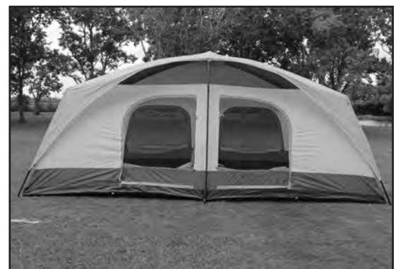
STEP 18 - This is how your tent with fly should look.