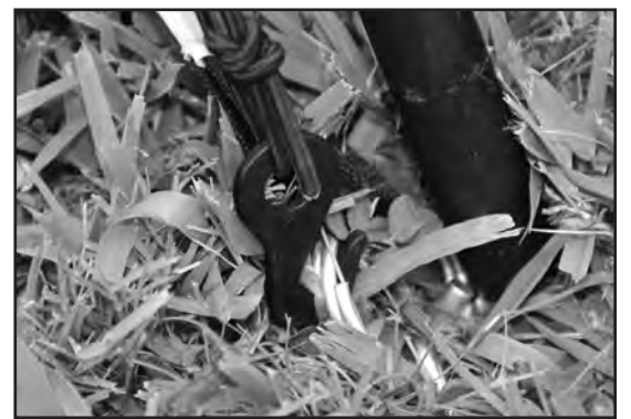
STEP 15 - Drape fly over tent and secure fly by attaching fly hook to ring.