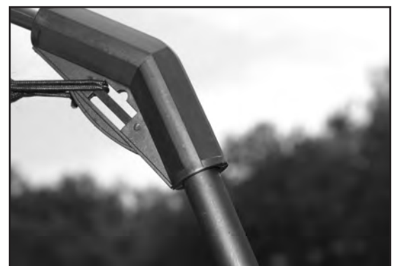
STEP 6 - Assemble the 2 center leg poles (F) and 4 corner leg poles (G) and insert into the attached molded joint. Some assistance may be required.