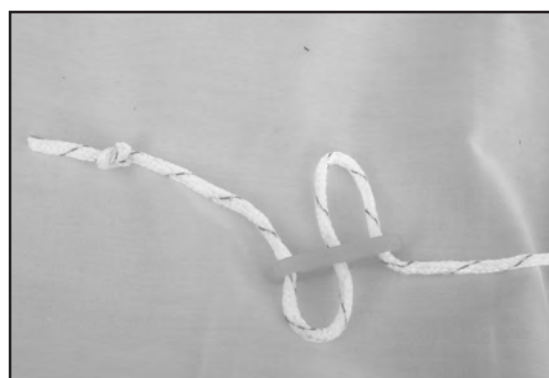
STEP 19 - To secure your tent with guy ropes. Insert the guy rope into clew as shown above.