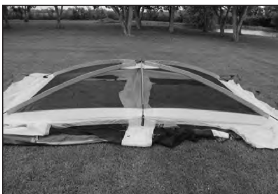
STEP 4 - This is how your tent should look at this point.