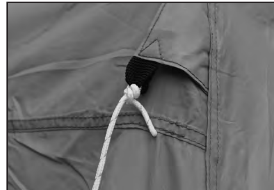
STEP 20 - Tie the other end of the guy rope to the tabs on the fly.