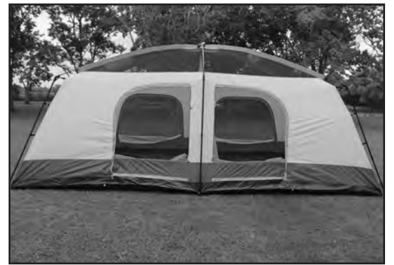
STEP 9 - This is how your tent should look at this point.