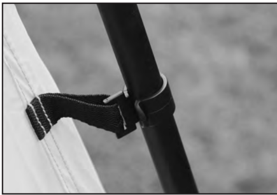
STEP 8 - Attach the speed clips onto the steel leg poles.