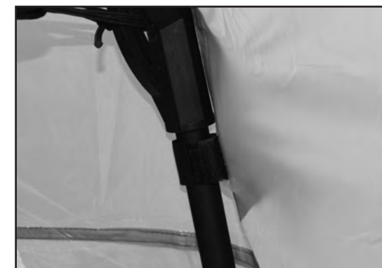
STEP 17 - Secure fly with the hook 'n' loops to the leg poles.