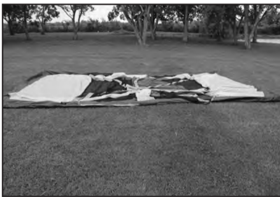
STEP 1 - Spread out tent skin.

Prepare your camp site by removing all sharp stones, twigs, etc. The site should be flat and have no depressions that could collect rain water.