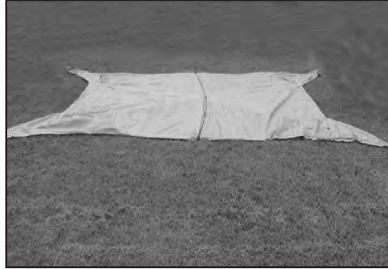
STEP 11 - Spread out fly.