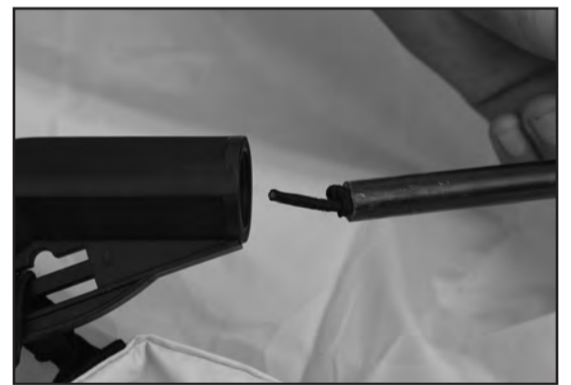
STEP 3 - Insert the roof poles into the attached molded joints.