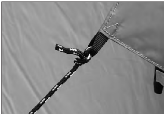
STEP 16 - Tie the other end of the guy rope to the tabs on the fly.