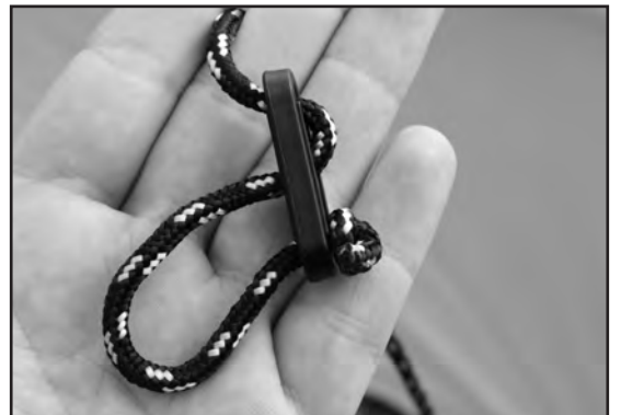
STEP 17 - Loosen the guy rope as shown to wrap around a stake.