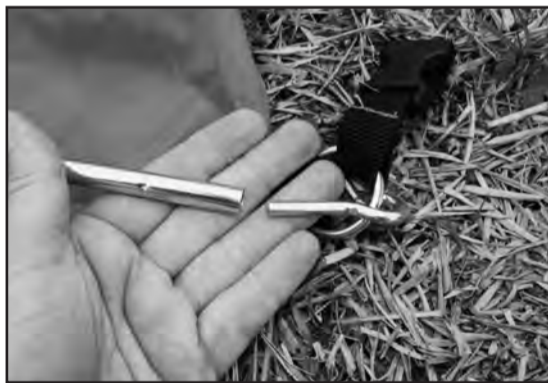
STEP 4 - Insert the pin and ring into the tent poles.