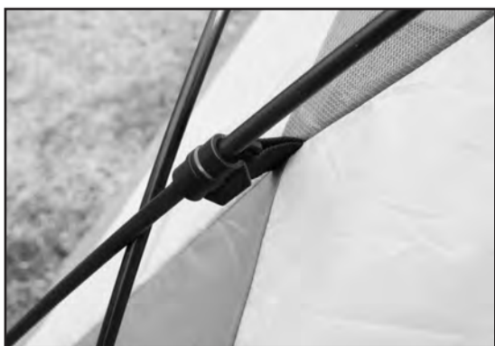
STEP 7 - Secure skin by snapping all speed clips onto the outer most tent pole.