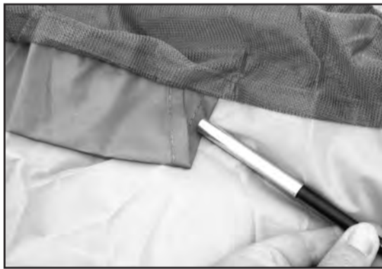
STEP 2 - Assemble the tent poles (C) and insert through the tent sleeves.