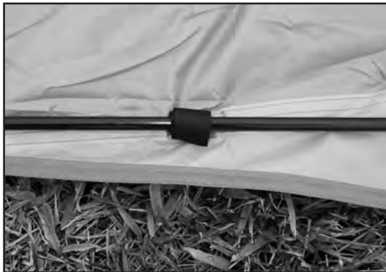
STEP 11 - Secure pole to fly with attached velcro.