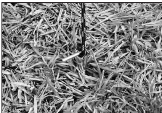
STEP 18 - Stake down the guy rope.