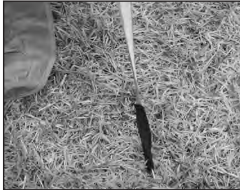
STEP 13 - Stake out the vestibule.