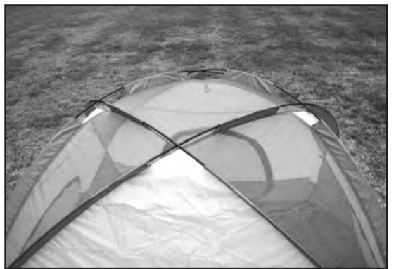
STEP 6 - Your roof poles should form 2 large X's.