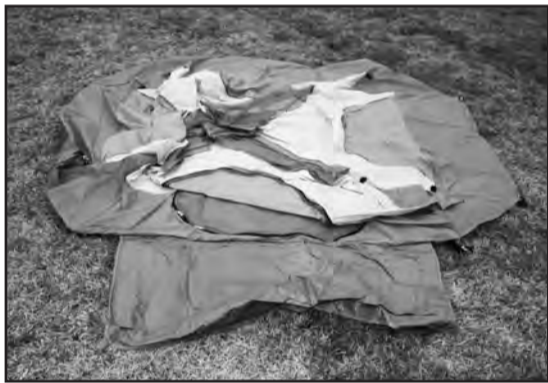
STEP 1 - Spread out tent skin.