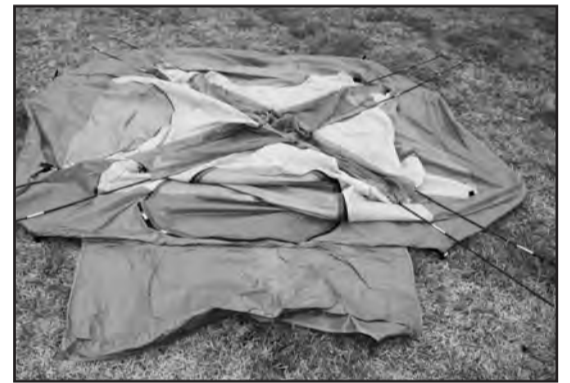
STEP 3 - Your poles should form double X as shown above.