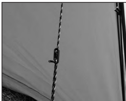
STEP 19 - Adjust the tension on the guy rope by sliding the clew up or down.