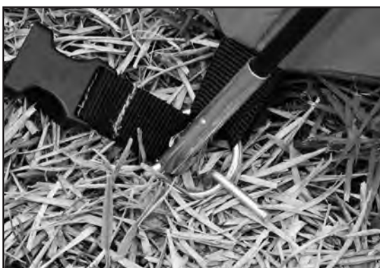
STEP 8 - Stake down at the ring.