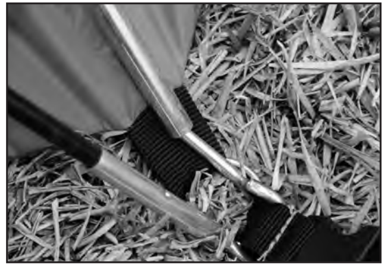
STEP 12 - Drape assembled fly over tent and insert the pin and rings into the fly pole.