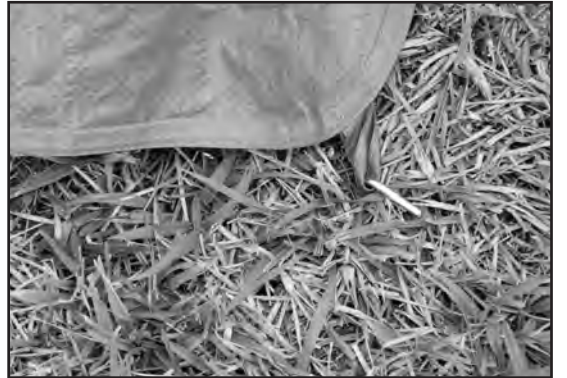
STEP 14 - Stake out the mud mat at the 2 corners.