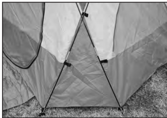
STEP 5 - Your tent poles should cross at the sides.