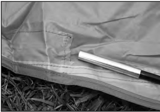
STEP 10 - Assemble the fly pole (B) and push through the sleeve.