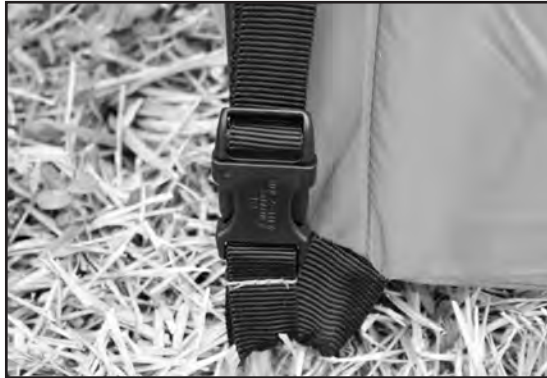
STEP 12 - Secure fly to tent with attached buckels. Pull or loosen web straps to adjust tension.