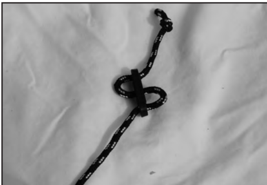
STEP 15 - It is recommended in windy weather to secure your tent with guy ropes. Insert the guy rope into clew as shown above.