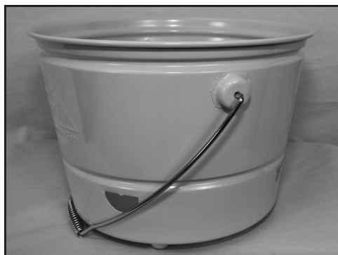
STEP 1 - Unpack all parts. Insert the handle into the side openings as shown.

Cooking should be done when you have a good bed of coals rather than cooking with the open flame. Be sure to drown the embers with water. Leave no trace, if you packed it in, pack it out!