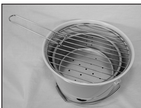
STEP 5 - Place cooking grate onto bucket. ENJOY!