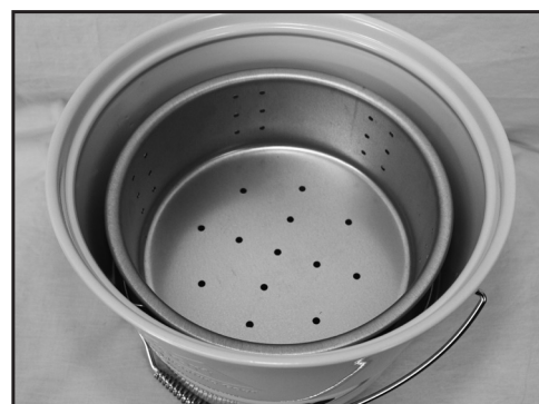
STEP 3 - Place charcoal bucket onto support as shown.