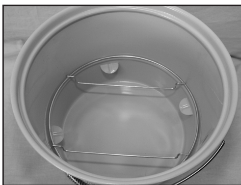
STEP 2 - Place the charcoal bucket support inside bucket.