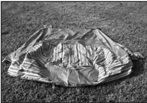
STEP 1 - Spread the cabana skin.