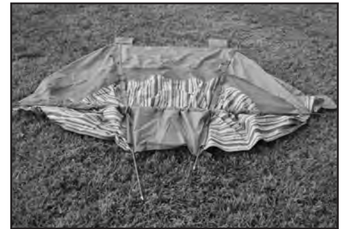
STEP 3 - Assemble the long pole and push it through the sleeve on the side of the cabana skin.