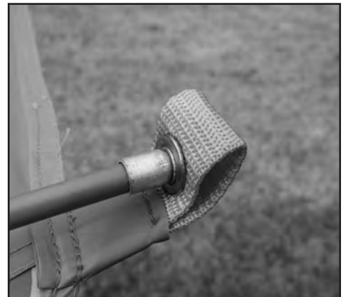
STEP 6 - Insert the pole pin into the grommeted web strap above the front opening of the cabana.