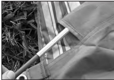
STEP 2 - Assemble 1 short pole and push it through the roof sleeve, ferrule side first. Repeat this step for the remaining short pole. DO NOT insert the pin into the pole.