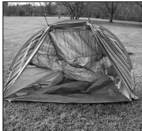
STEP 5 - Insert the pin and ring into the ferrule of the rear short poles.