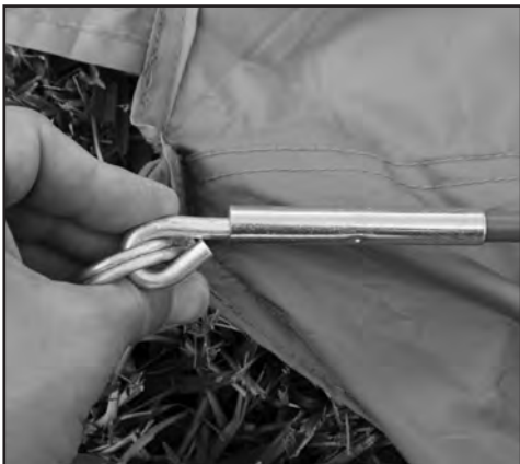
STEP 4 - Insert the pin and ring into the ferrule end of the long side pole. Do this on both ends.