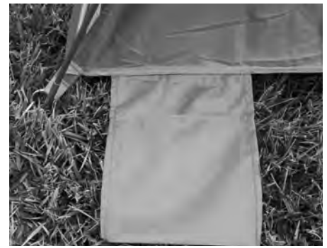
Step 9 - Add weight (sand) in the bags to secure your cabana in high winds.