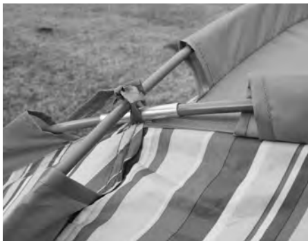
Step 7 - Secure all poles with ties on the roof skin as shown above.