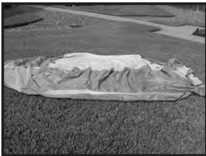
Step 1 - Spread out shelter skin (B).