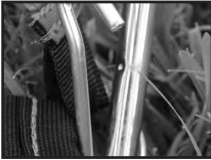
Step 7 - Stake down at the ring and tabs around shelter.