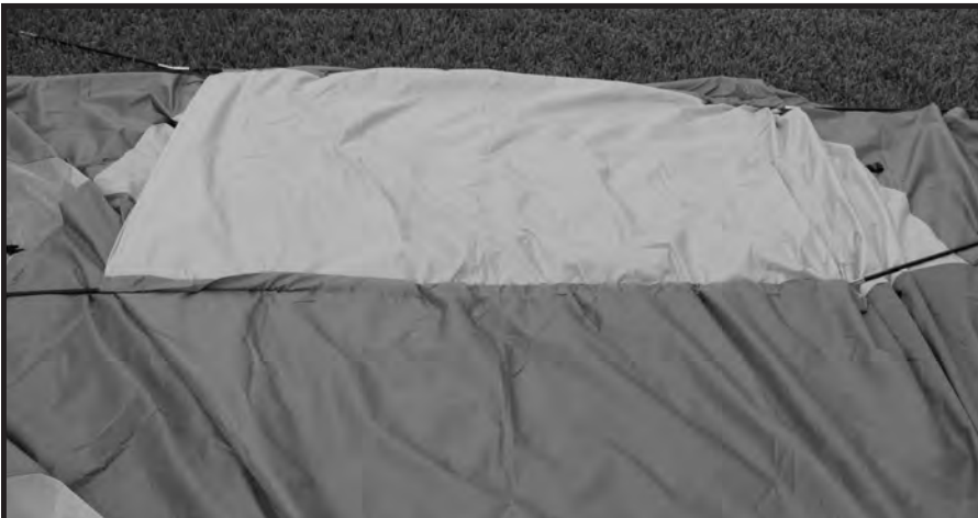
Step 3 - Crisscross poles to form an "X" on the side of the shelter.