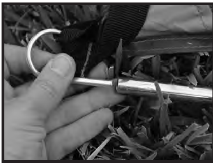
Step 4 - Insert the pin and ring into the poles on all rings.