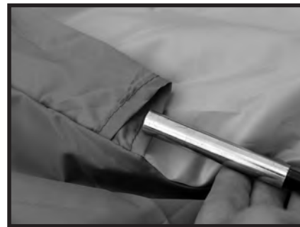
Step 2 - Assemble the 2 fiberglass poles (A) and insert through the shelter sleeves.