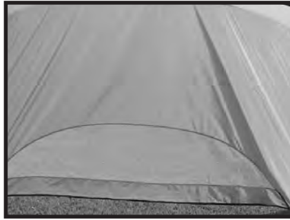
Step 8 - This is how your built shelter should look. Enjoy!

WARNING: Texsport tent fabrics are flame retardant treated per C.P.A.I.-84 specification. However, for your safety, we recommend that NO OPEN FLAME BE USED IN OR NEAR YOUR TENT.