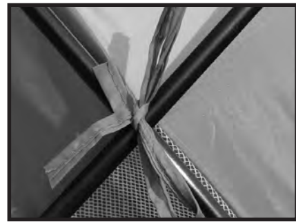
Step 6 - Tie poles at the sides of the shelter.